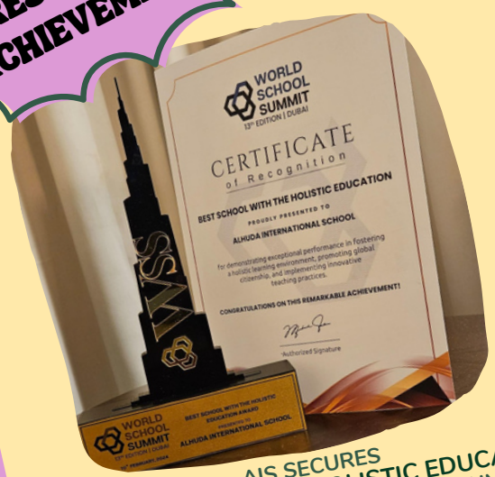
AIS SECURES 'BEST SCHOOL WITH HOLISTIC EDUCATION' AWARD AT THE WORLD SCHOOL SUMMIT (DUBAI | FEB 10, 2024)